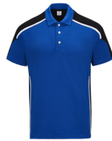
L11-07 Royal Blue/Black