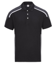
L11-01 Black/Dark Grey